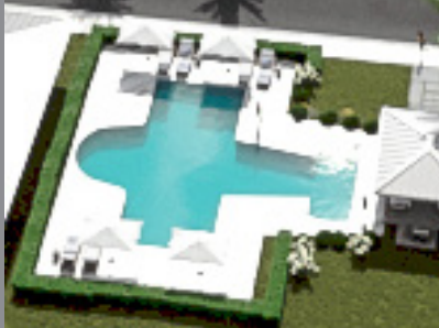
Airplane Shaped Swimming Pool

Centrally located airplane-shape swimming pool with 40 FT lap pool, shallow zone for kids and Jacuzzi Tub.