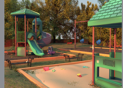
Playground and Garden

One large detached cabana is situated between the swimming pool and playground to provide a shaded relaxing area perfect for residents of all ages.